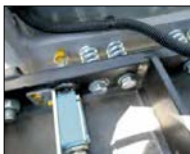
Overload, roof presence & physical locking sensor.