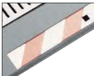
Safety: front opening only if in contact with the roof